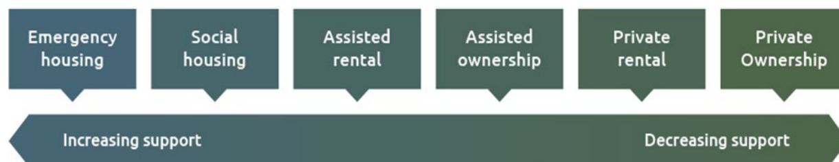
Figure 1: The housing continuum (Auckland Council, 2019)

Table 1 looks at each housing type, providing details of the key system ‘actors’, such as government initiatives, and examples of community providers and models/approaches.