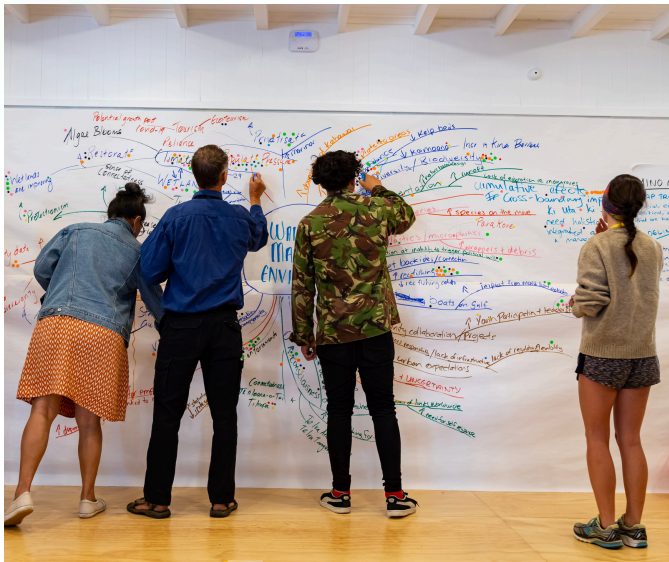
Image: Participants mind mapping

“It’s hard work being mana whenua. When you can feel the ihi and the wana rise, the power of positive collaboration and respect for one another start to flicker in the most distant minds, then it is worth it. We are bringing our whole(some) selves into relationship with place, culture and one another.”