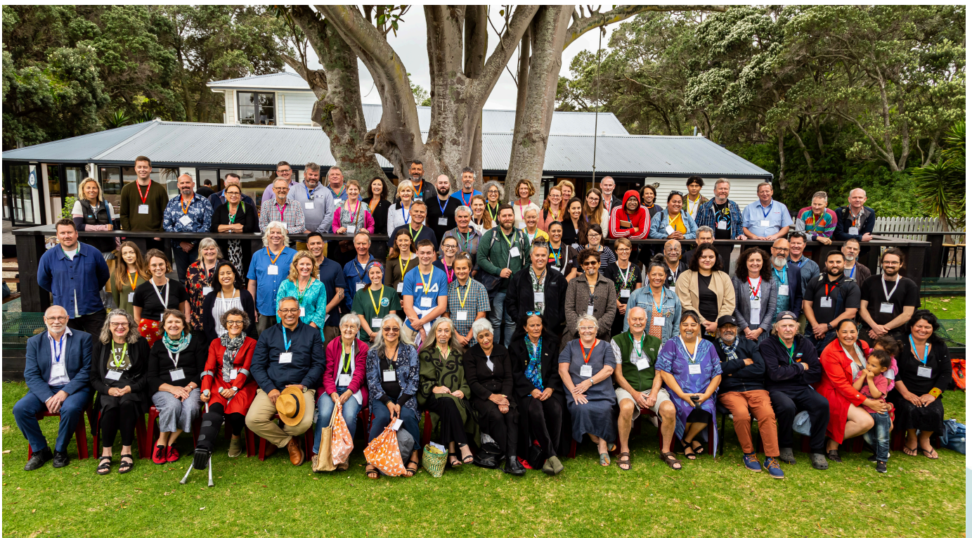
Image: Participants of the Waiheke Marine Project

In particular, the Pipi page of the WMP website gives details of the many hope-filled projects that are underway.