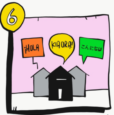
Inter-cultural programmes at neighbourhood level that promote inclusion & tackle racism