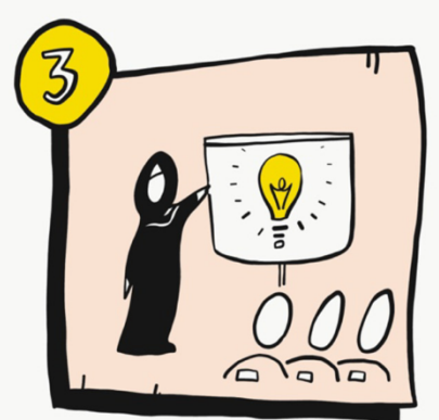
Cultural Competency training for local & central government, delivered by communities