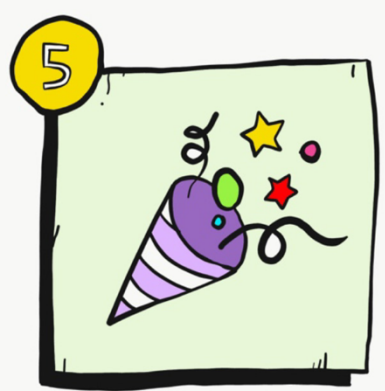
Support & celebrate young people to explore their new multi-identities